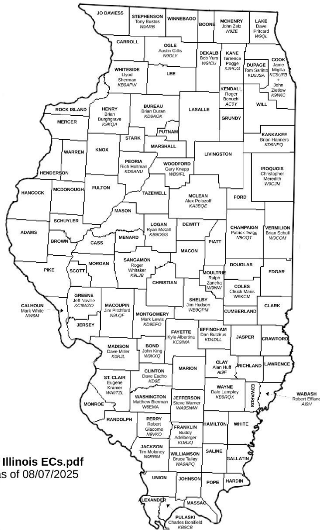
Map of Illinois ECs.pdf Data as of 08/07/2025